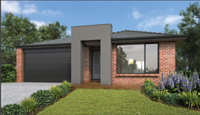
Image used for illustrative purposes. *Price based on facade type shown. Price excludes options/upgrades such as roof upgrades, render, feature front doors, garage doors, window furnishings, light fittings and items not supplied by Dennis Family Homes such as decking, landscaping and fencing unless otherwise specified.