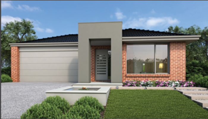
Image used for illustrative purposes. *Price based on facade type shown. Price excludes options/upgrades such as roof upgrades, render, feature front doors, garage doors, window furnishings, light fittings and items not supplied by Dennis Family Homes such as decking, landscaping and fencing unless otherwise specified.